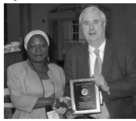
Mayor Carrie Fulghum, Gainesville