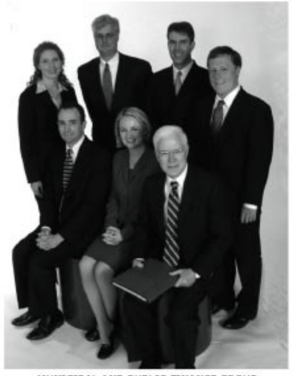
MUNICIPAL AND PUBLIC FINANCE GROUP

In accordance with the Alabama State Bar requirements, no representation is made that the quality of the legal services to be performed is greater than the quality of legal services provided by other lawyers.